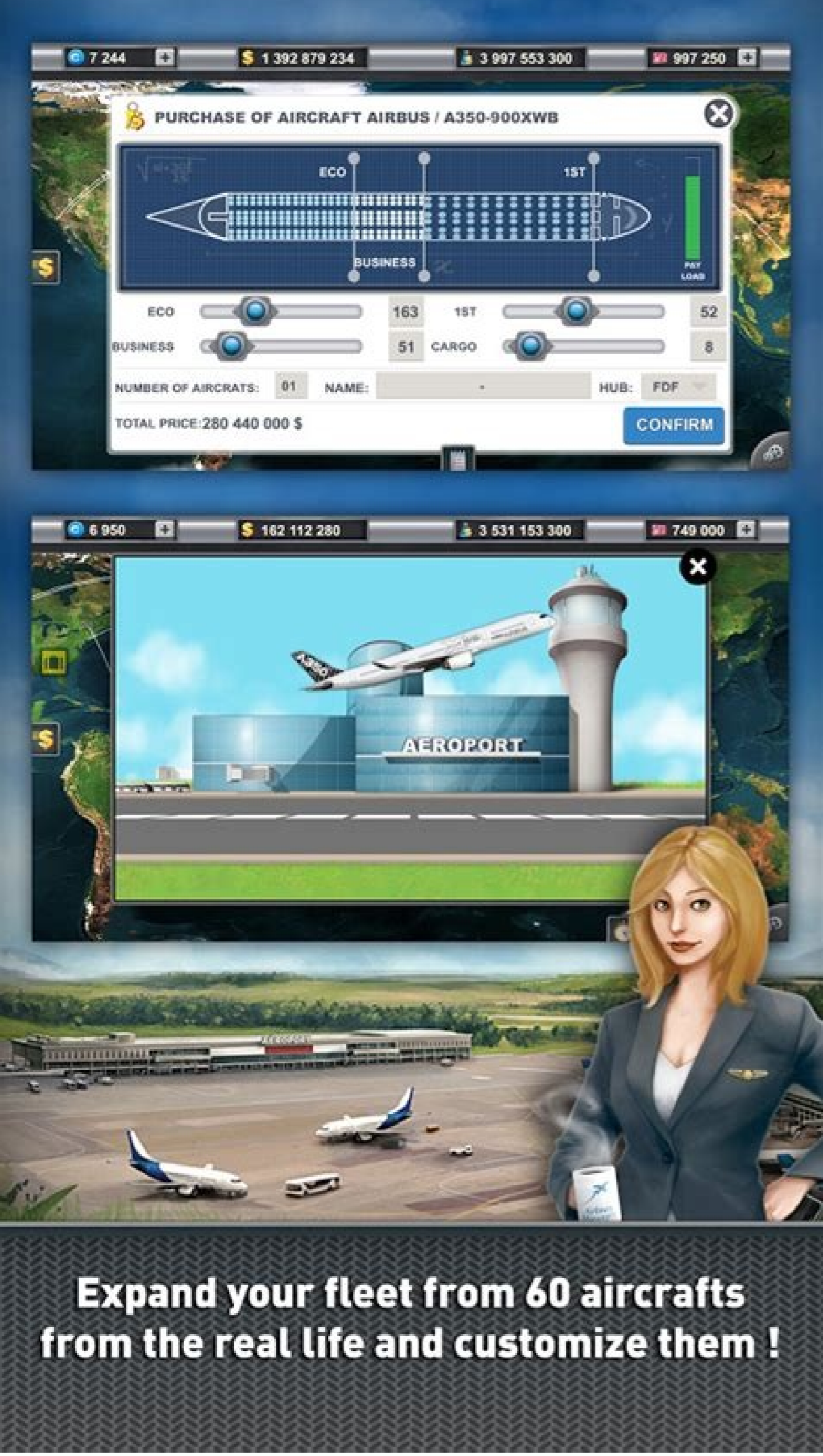
Airline manager tycoon hack android. Airline manager 4 tricks. How to hack airline manager. How to hack airline manager 4. Cara hack airline manager android. Best airline manager game android.